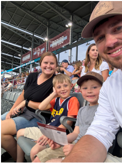
Taking in a soccer game