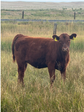
LTH Chesney E081 N015 Plainsman Daughter