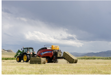
Amy baling hay on the Pitchfork Ranch Meeteetse, WY